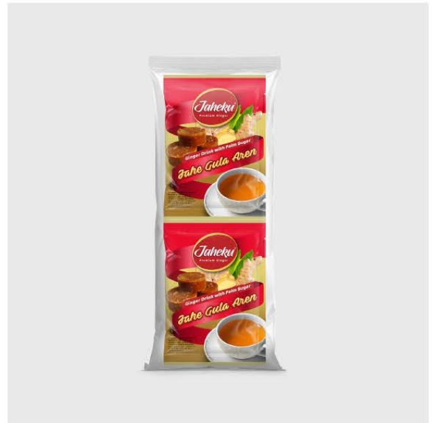
Jahe Gula Aren - P10

Content: 25 bags Net Weight: 5kg Gross Weight: 5.7kg Dimension: 425 x 230 x 216 mm