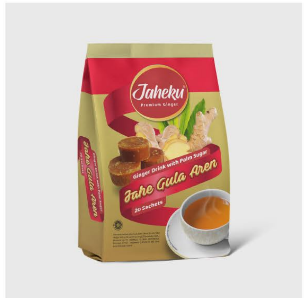
Jahe Gula Aren - P20

Content: 12 bags Net Weight: 4.8kg Gross Weight: 5.5kg Dimension: 425 x 230 x 216 mm