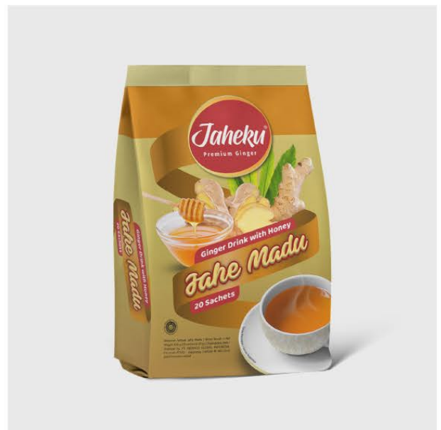
Jahe Madu - P20

Content: 12 bags Net Weight: 4.8kg Gross Weight: 5.5kg Dimension: 425 x 230 x 216 mm